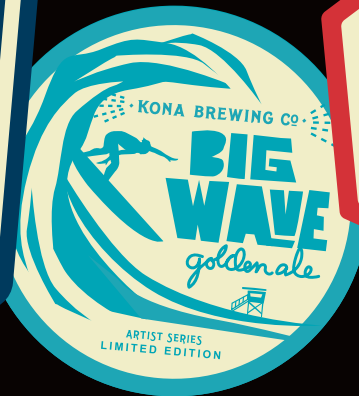
THE SLAB CIRCLE STICKER