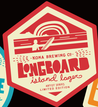
IN-BETWEEN SETS HEXAGON STICKER